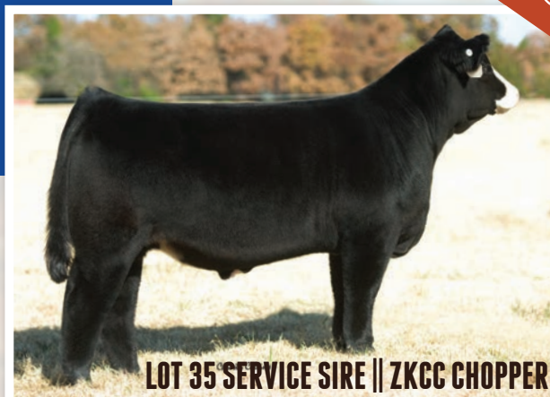
LOT 35 SERVICE SIRE || ZKCC CHOPPER