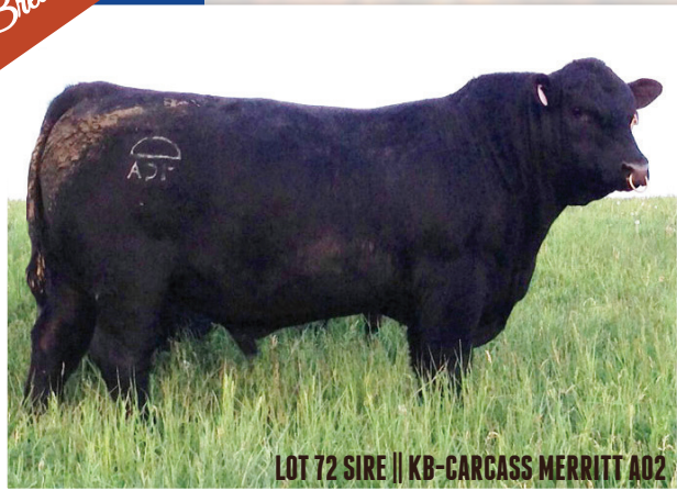
LOT 72 SIRE || KB-CARCASS MERRITT A02