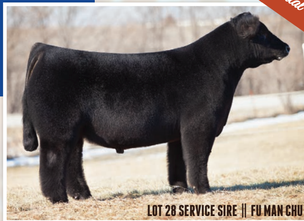
LOT 28 SERVICE SIRE || FU MAN CHU