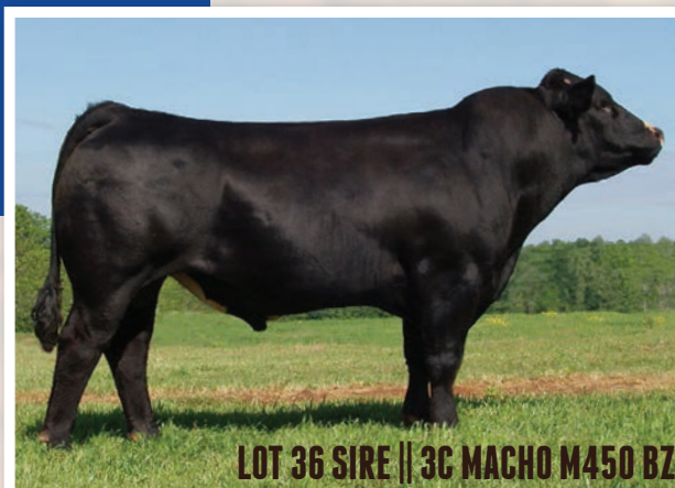
LOT 36 SIRE || 3C MACHO M450 BZ