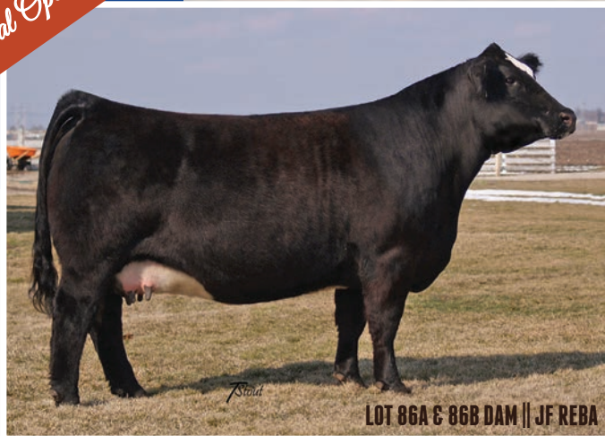
LOT 86A & 86B DAM // JF REBA