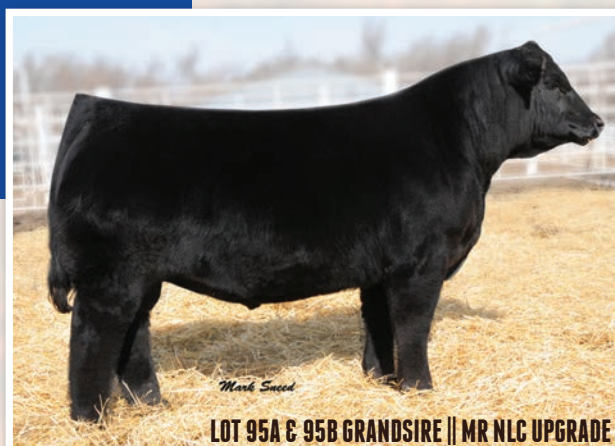
LOT 95A & 95B GRANDSIRE || MR NLC UPGRADE