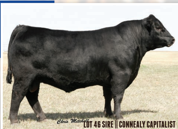
LOT 46 SIRE || CONNEALY CAPITALIST