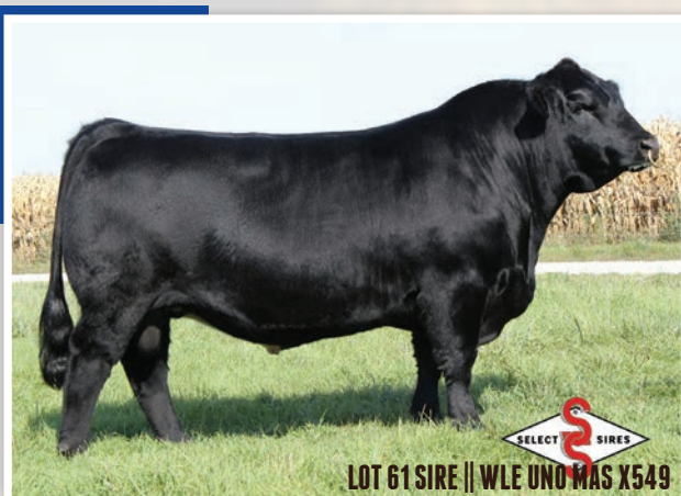
LOT 61 SIRE || WLE UNO MAS X549