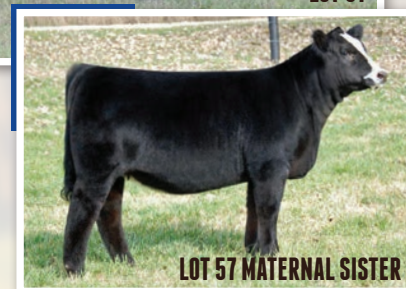
LOT 57 MATERNAL SISTER