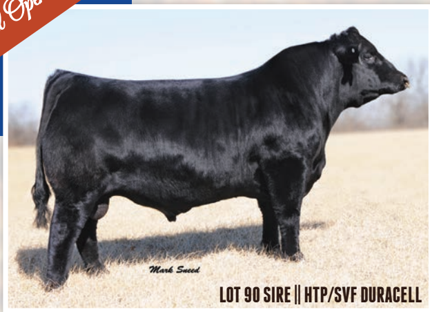
LOT 90 SIRE || HTP/SVF DURACELL