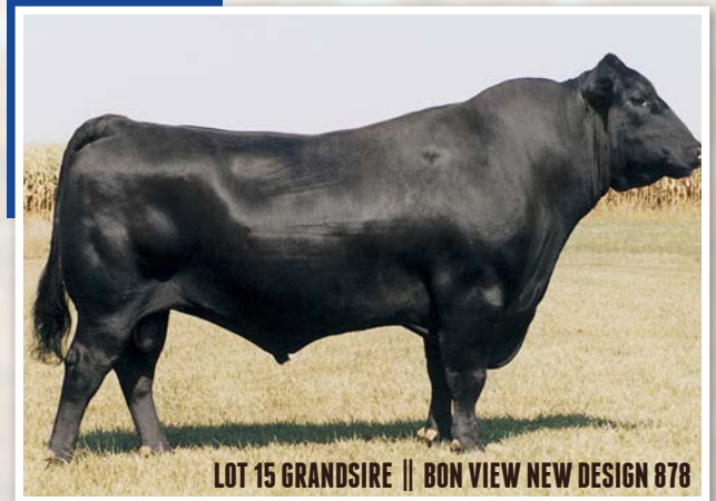
LOT 15 GRANDSIRE || BON VIEW NEW DESIGN 878

- Z05 is a maternal sister to BAF Fast Break 924W