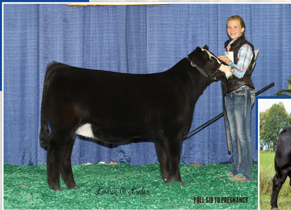
FULL SIB TO PREGNANCY