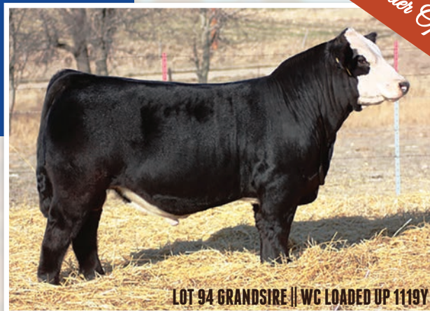
LOT 94 GRANDSIRE || WC LOADED UP 1119Y

- This black baldy booted heifer will be a great show heifer. Don't miss the chance to buy a female with Loaded Up in her pedigree. They have the look that everybody wants today.