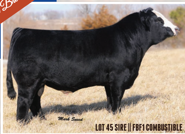
LOT 45 SIRE || FBF1 COMBUSTIBLE