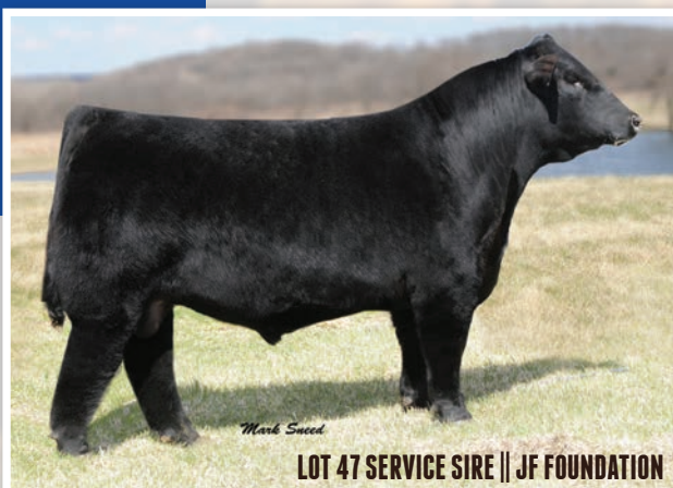
LOT 47 SERVICE SIRE || JF FOUNDATION