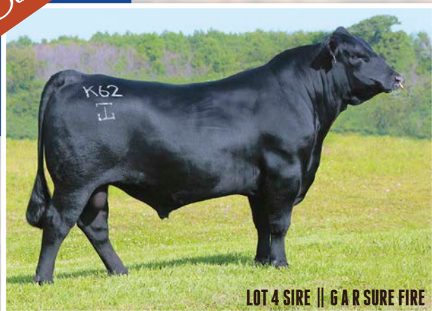
LOT 4 SIRE || G A R SURE FIRE