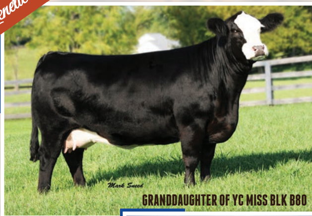
GRANDDAUGHTER OF YC MISS BLK B80