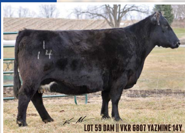
LOT 59 DAM || VKR 6807 YAZMINE 14Y