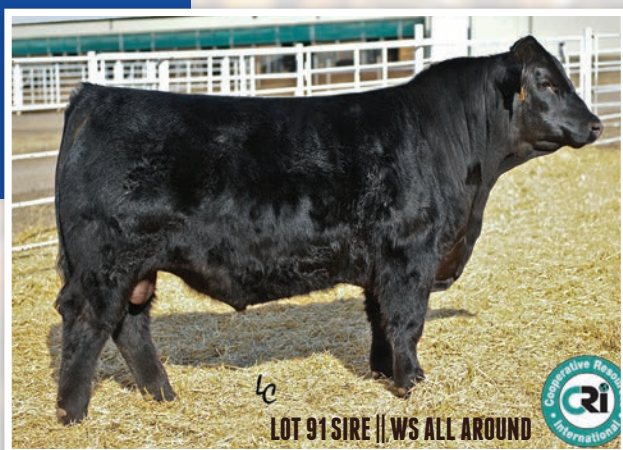
LOT 91 SIRE || WS ALL AROUND