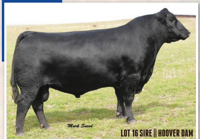
LOT 16 SIRE || HOOVER DAM

- AI'd 3/16/17 to S Chisum 3188 (AAA# 17594860)