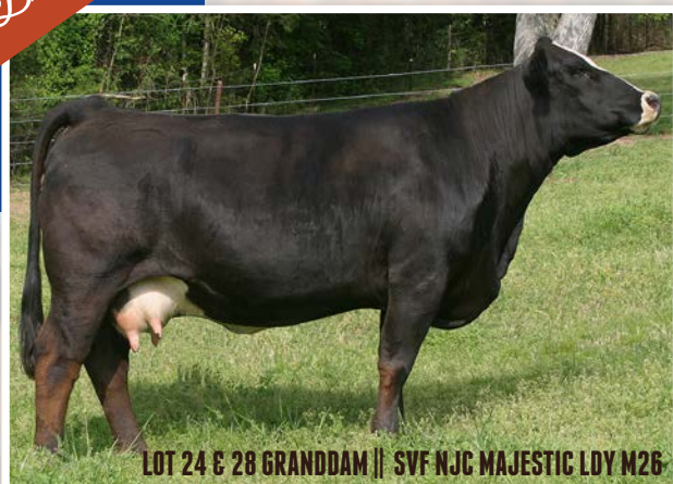
LOT 24 & 28 GRANDDAM || SVF NJC MAJESTIC LDY M26