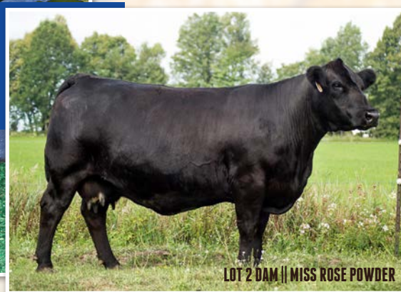
LOT 2 DAM || MISS ROSE POWDER