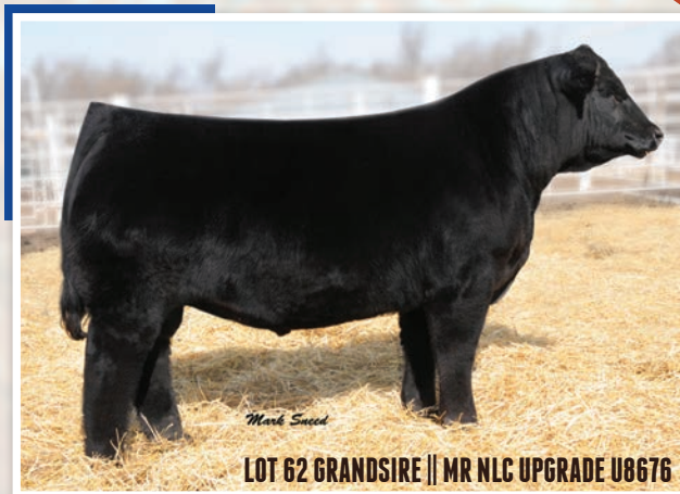
LOT 62 GRANDSIRE || MR NLC UPGRADE U8676