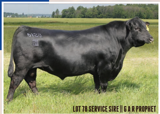
LOT 78 SERVICE SIRE || G A R PROPHET

- Here is a bred heifer with a pedigree combining Ten X and Rampage, two of the best performance sire in the breed. Her genomic enhanced EPD profile shows exceptional calving ease & low birth weight along with a weaning and yearling weight in the top 10% of the breed. She also ranks in the top 15% for 10 of the measurable traits. EPDs enhanced by i50K. She sells bred to G A R Prophet, due 3-3-18.