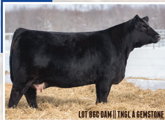
LOT 86C DAM // TNGL A GEMSTONE