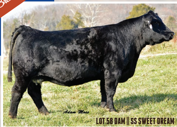
LOT 58 DAM || SS SWEET DREAM