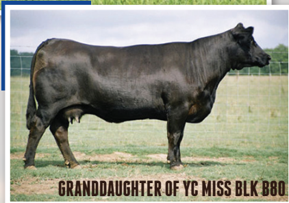
GRANDDAUGHTER OF YC MISS BLK B80