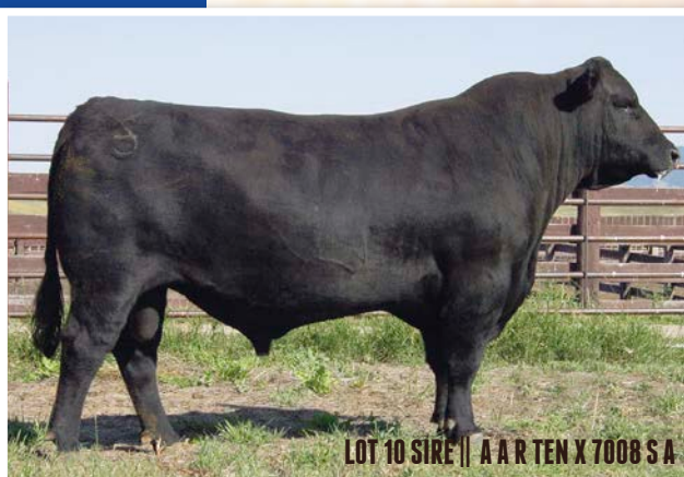
LOT 10 SIRE || A A R TEN X 7008 S A