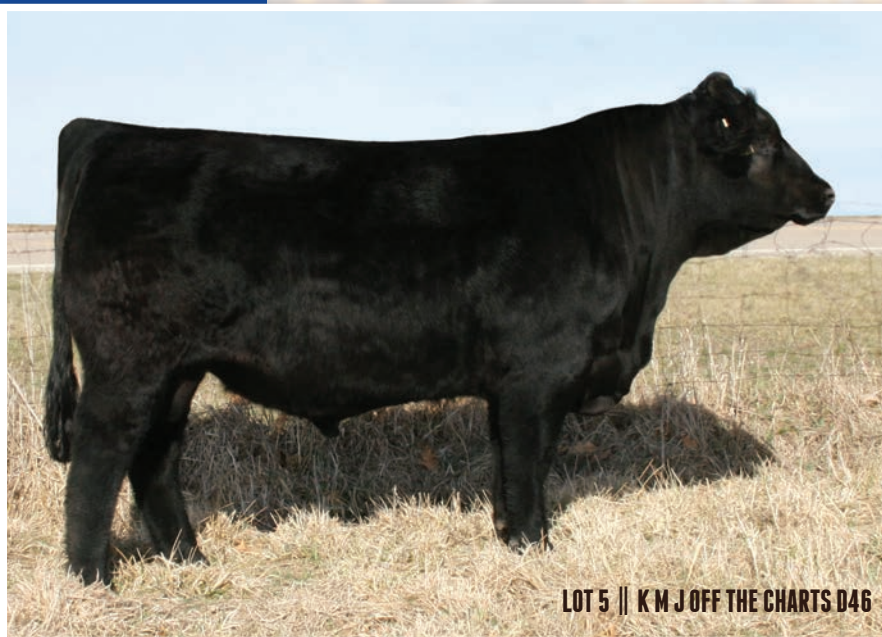
LOT 5 || K M J OFF THE CHARTS D46