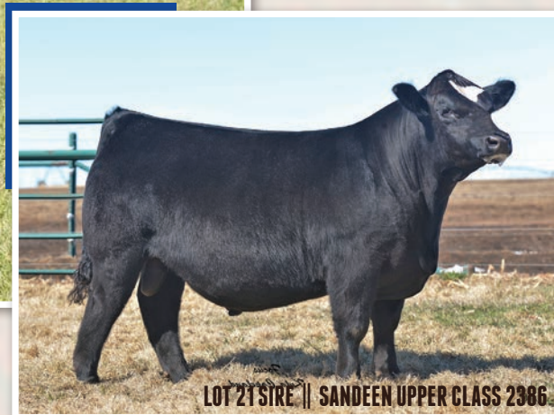
LOT 21 SIRE || SANDEEN UPPER CLASS 2386