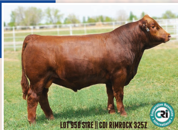
LOT 95B SIRE || CDI RIMROCK 325Z