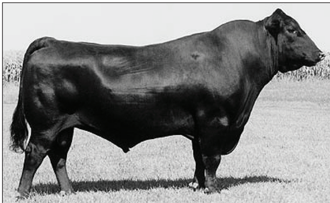
Bon View New Design 878 - Sire of Lot 5a