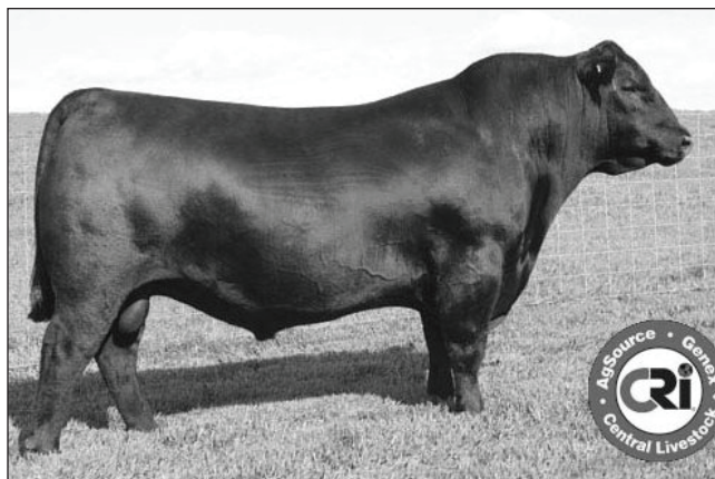
SAV Bismarck 5682 - Sire of 7a, 33, and Lot 15 pregnancy