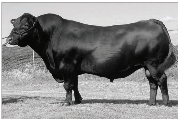
G A R Retail Product - Maternal grand sire of Lot 28