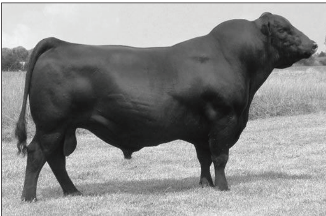
B/R New Day 454 - Sire of Lot 20 pregnancy